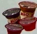
Jello and Pudding