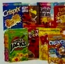
Hospitality Size Cereals