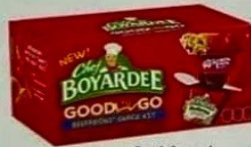
Pasta & Meat Snack Packs