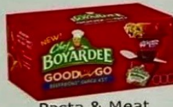
Pasta & Meat Snack Packs