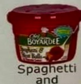
Spaghetti and Meat Balls