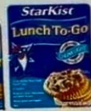
Tuna Snack Packs