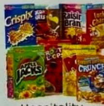
Hospitality Size Cereals