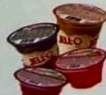
Jello and Pudding