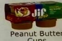
Peanut Butter Cups